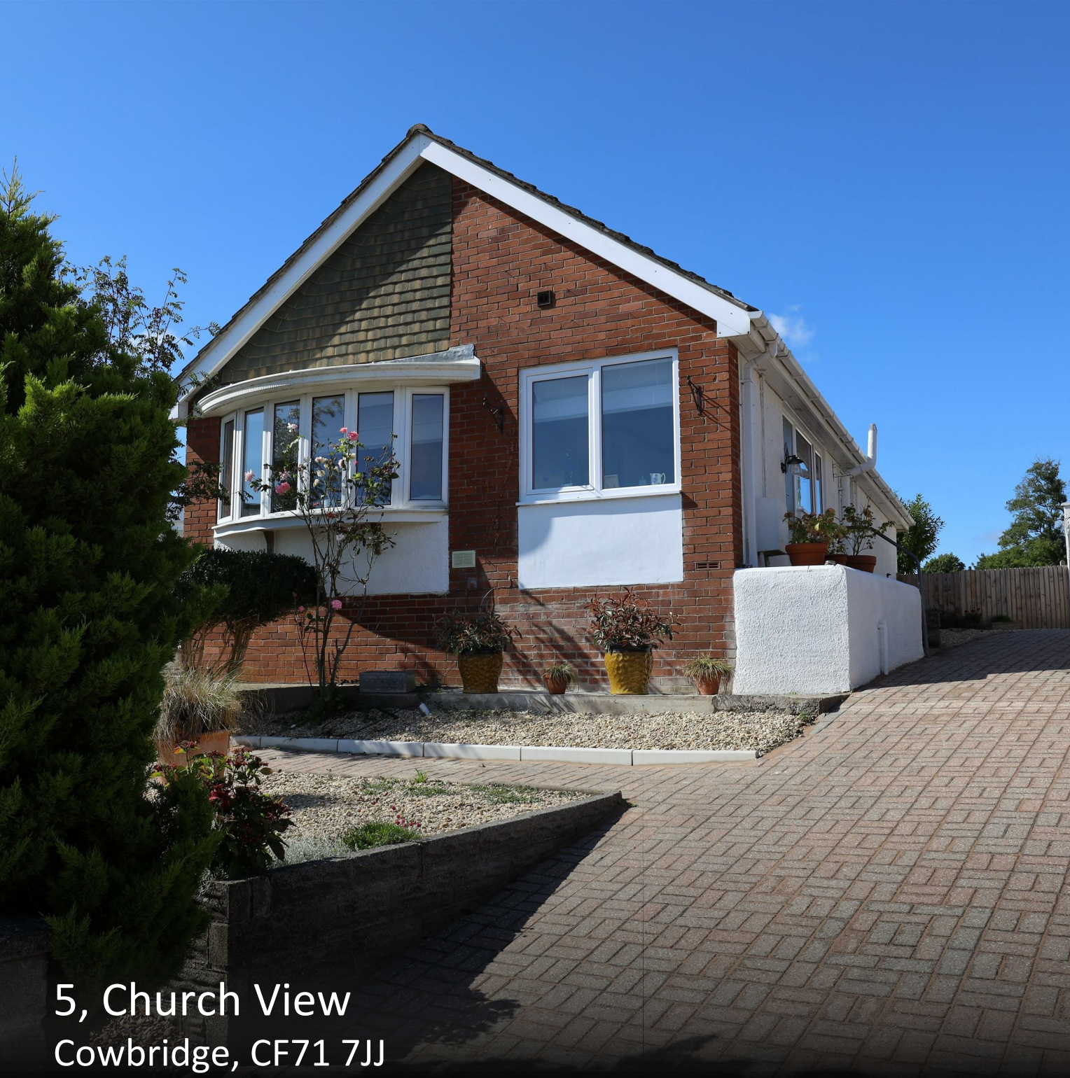
5, Church View Cowbridge, CF71 7JJ